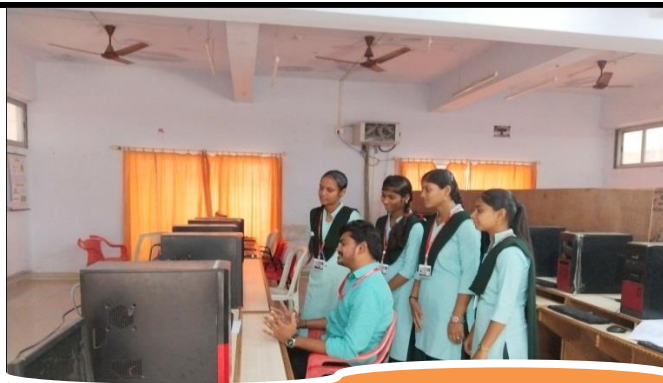
INTERNET & NETWORK LAB