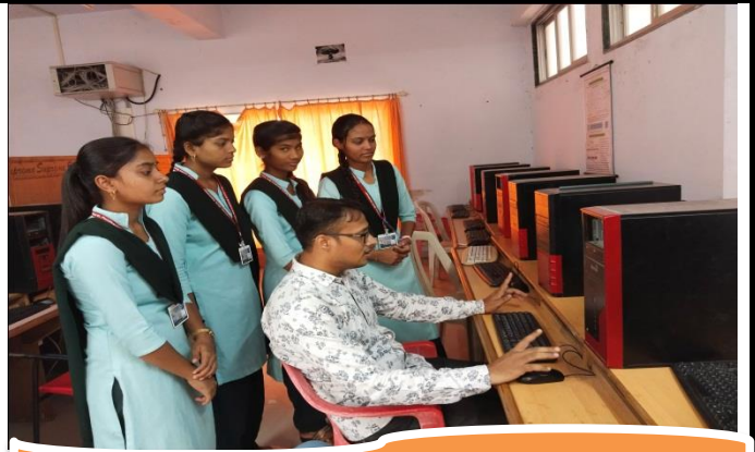
COMPUTER CENTER LAB